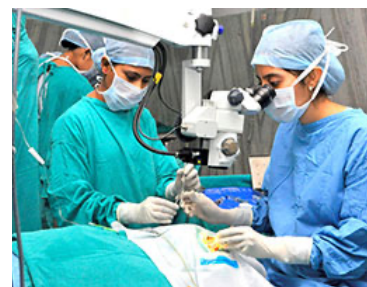
SICS training at SNC

The aim of the hospital is to provide High Quality and Affordable Comprehensive Eye Care services to the masses. With the support of its 58 Vision centers in the various districts of Uttar Pradesh & Madhya Pradesh, the hospital is able to reach a million patients a year. Its State-of-the-Art 26 Modular operation theaters and 120+ Ophthalmologists are supporting more than 1.3 lakh surgeries a year. Sadguru Netra Chikitsalaya has more than 110+ publications both on national and international platforms.